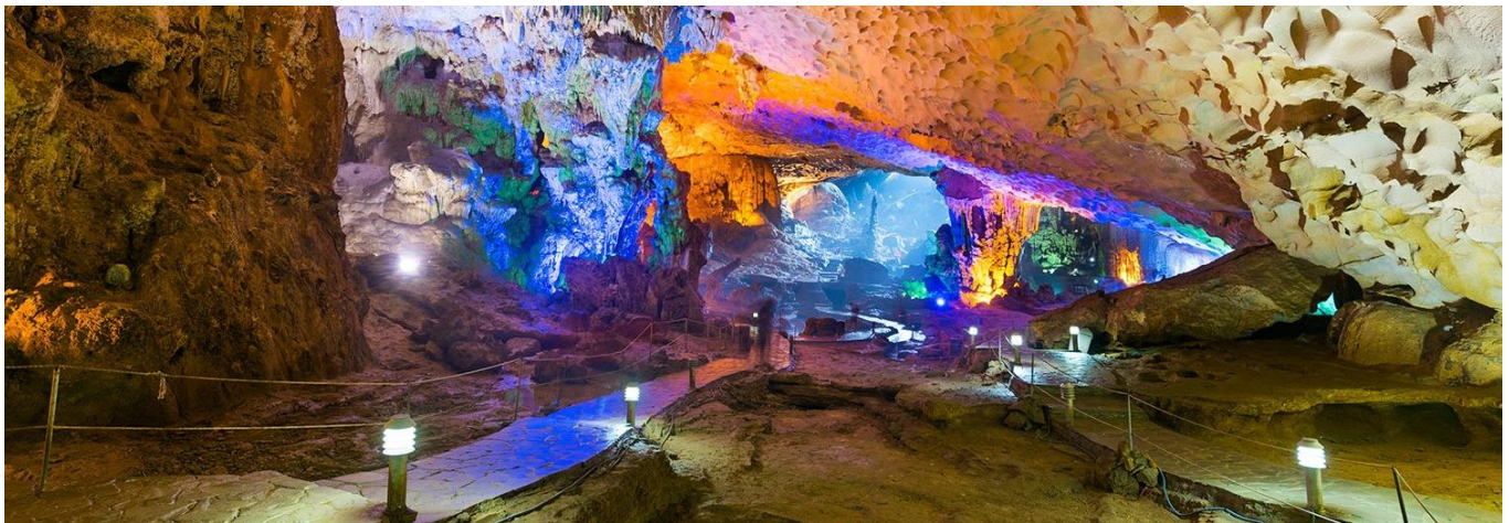
Thien Cung Cave- Halong bay

Leave for Halong Bay was awarded by UNESCO as a natural heritage in 1994. This four hour drive will show you the diversity of the North Vietnam villages and rice fields along the journey. Upon arrival, we start enjoying 4 hour boat trip. We walk into the Thien Cung cave (Heaven Palace cave) to see thousands of stalactites and stalagmites colored by hundreds of neon lights.