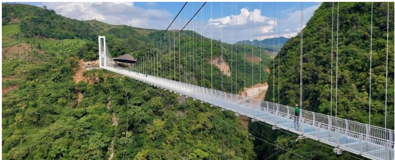
Bach Long glass Bridge - Guinness World Records