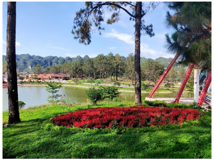
Ang Pine Tree Village – Moc Chau

After that, we transfer to Bat Cave has an area of over 7,000 square meters, 100m in height and 930m long. Follow the 240-steps to the entrance of this National historical and cultural site. The interior of this impressive limestone cave is wonderous in its riches—from the twinkling, multi-colored stalactites (which eerily resemble Buddhas, elephants, tigers, eagles...), to the dry lake located in the center of the cave.