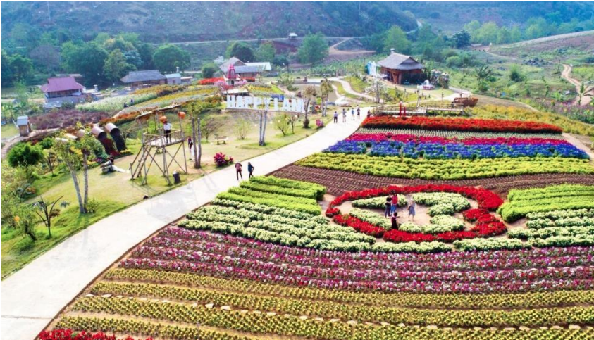
Happy Land – Moc Chau