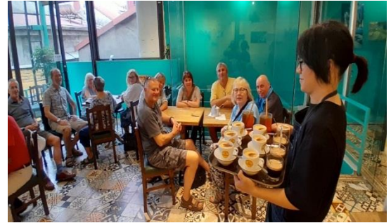
Eggs coffee in Hanoi Old Quarter

Lunch and dinner at local restaurant – Vietnamese Food