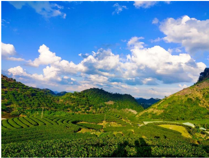
Heart Tea Hill – Moc Chau

Visit Heart Tea Hill , perhaps this is not only the most beautiful tea hill of Moc Chau Plateau but also the most beautiful tea hill of Vietnam because of the round and winding green tea beds as far as the eye can see. Romantic and peaceful. This is also the raw material area to produce the famous brand, which is Oolong tea.